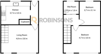
Total approximate area - 62.4 sq meters (671.6 sq feet)

Robinsons produced by Woodside Photography Floorplans for illustration purposes only and all measurements are approximate