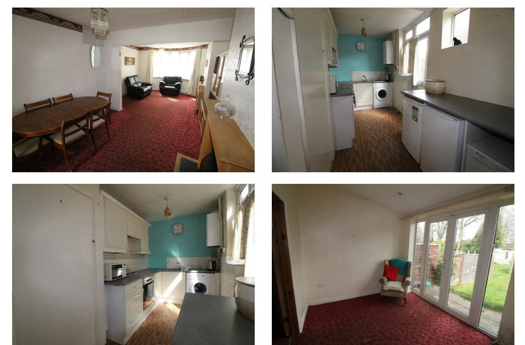
These particulars, whilst believed to be accurate are set out as a general outline only for guidance and do not constitute any part of an offer or contract. Intending purchasers should not rely on them as statements of representation of fact, but must satisfy themselves by inspection or otherwise as to their accuracy. No person in this firms employment has the authority to make or give any representation or warranty in respect of the property.

20 West Street, Dunstable, Bedfordshire, LU6 1SX